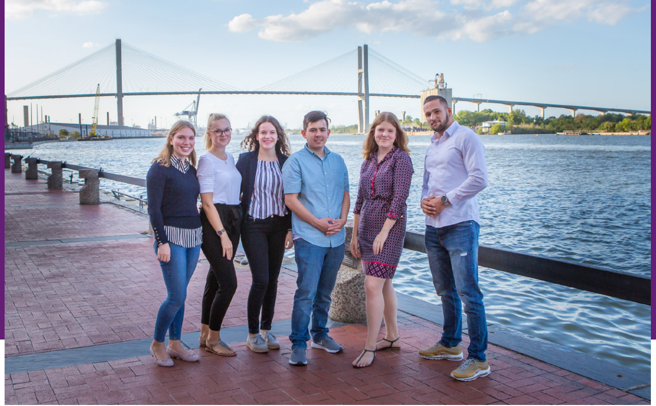
▲ German apprentices at the Gateway of the Port of Savannah

on our website or contact us for information and advice: GATE - German Apprenticeship Training Exchange www.joachim-herz-stiftung.de/gate/en